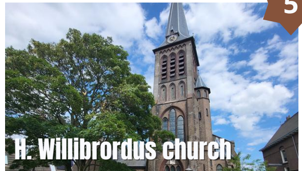
H. Willibrordus church